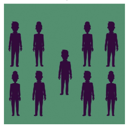
About 3/4 of people injured through violence and treated in EDs don't tell the police - so the information you collect and share anonymously contributes vital pieces of a jigsaw.