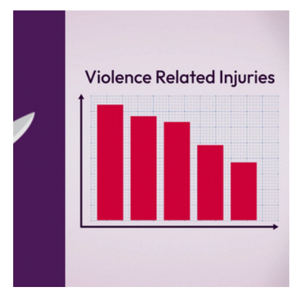
We know that is system prevents violence-related injuries, especially knife and gang related assaults.

Together with policing and local authority data, it's clear that the club is a hotspot for anti-social behaviour. So, increased security and community safety measures can be put in place.