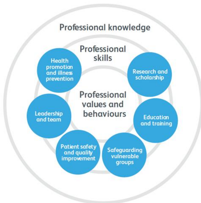
The nine domains of the GMC's Generic Professional Capabilities

Good medical practice (GMP) 2 is embedded at the heart of the GPC framework. In describing the principles, duties and responsibilities of doctors the GPC framework articulates GMP as a series of achievable educational outcomes to enable curriculum design and assessment.